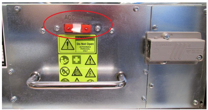
Figure 5: Figure 5 - replace battery fuse

The batteries inside the power supply are fused to prevent damage in case of failure as they can deliver very high currents. The fuse needs to be inserted by the user, if you operate the crate for the first time. Also it is mandatory to remove the fuse for transportation, to comply with the safety regulations! The fuse is accessible on the back of the power supply unit, follow the steps described in 4.1 Replacing the power supply for detaching the case lid. Insert the fuse firmly in the slot next to the mains connector labelled "ACCU-Fuse".