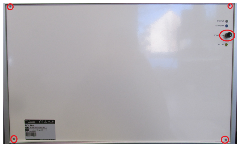
Figure 1: Remove back cover to replace power supply

You now see the power supply, cut loose the cable tie and unplug the mains cable. Take the slotted-head screwdriver and unscrew the two slotted-knurled screws in an alternating manor to avoid tilting the power supply inside the frame. Sometimes a firm pull is needed to completely remove the power supply from the crate.