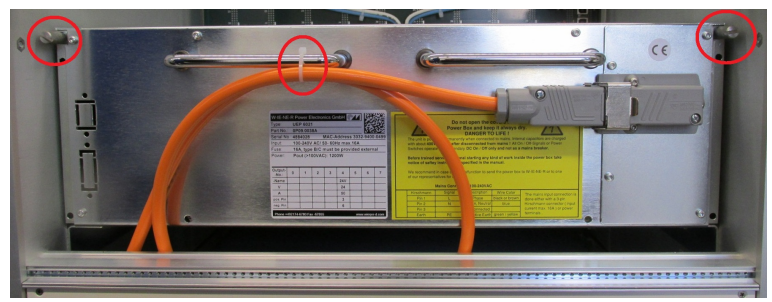
Figure 2: remove wire tie and loosen screws

You now see the power supply, cut loose the cable tie and unplug the mains cable. Take the slotted-head screwdriver and unscrew the two slotted-knurled screws in an alternating manor to avoid tilting the power supply inside the frame. Sometimes a firm pull is needed to completely remove the power supply from the crate.