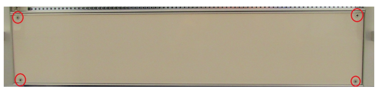
Figure 3: remove cover to replace fan tray

Before replacing the fan tray, set the power supply into standby-mode, disconnect from mains and wait a few minutes. Needed tools are a Phillips- and an Allen-head ( size three) screw driver. Begin with removing the blue sticker on the module side of the crate, unscrew the four Phillips-head screws and detach the lid.